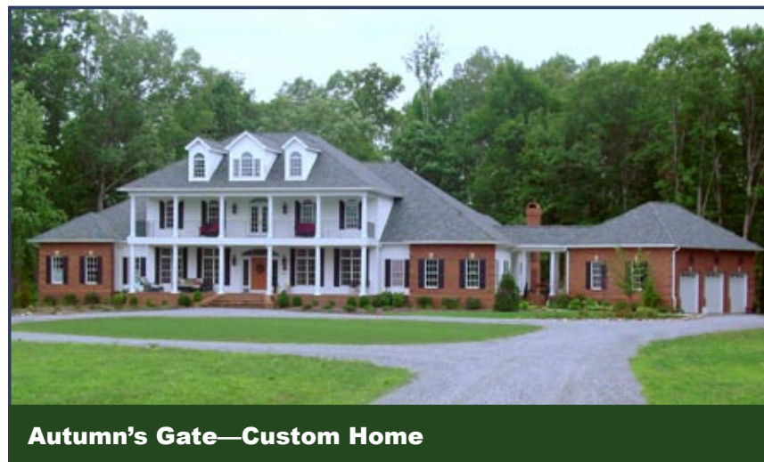
Autumn's Gate—Custom Home