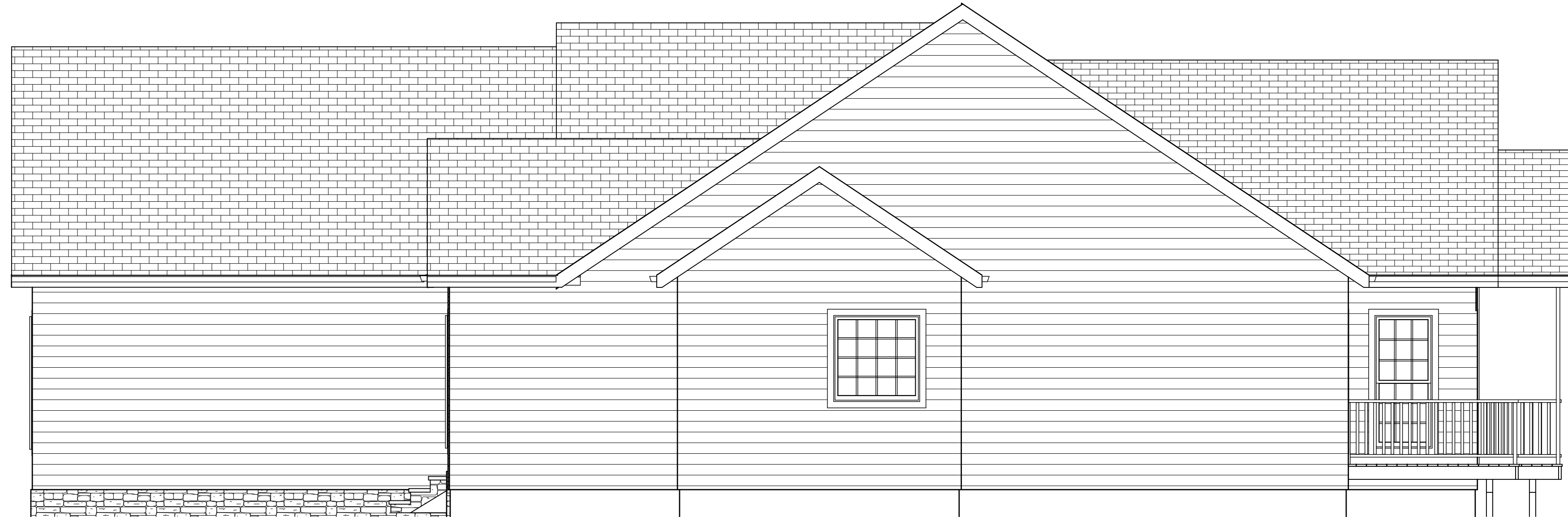
RIGHT ELEVATION (1/4" = 1')