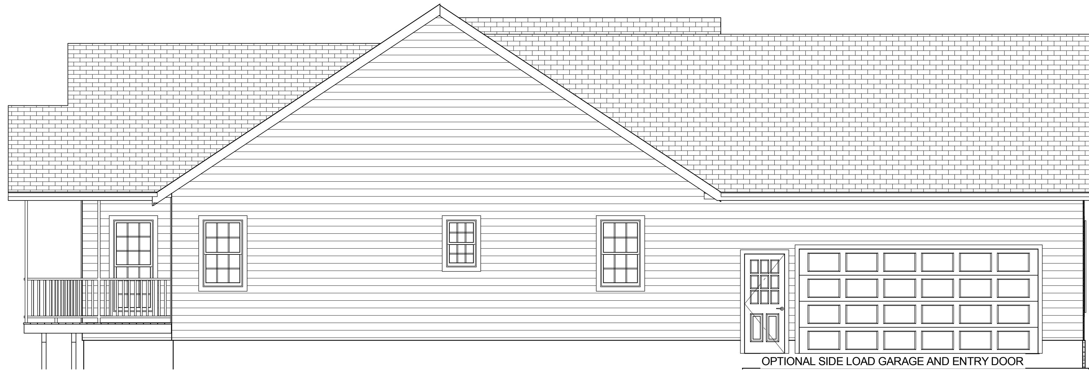
LEFT ELEVATION (1/4" = 1')