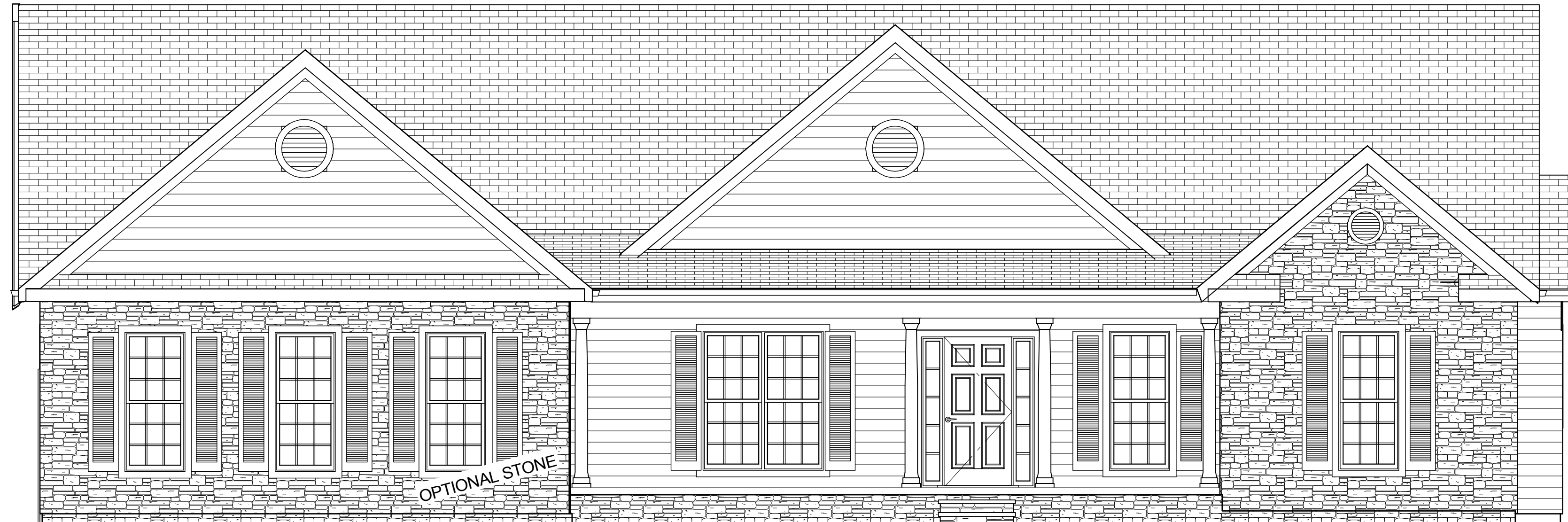
FRONT ELEVATION (1/4" = 1')