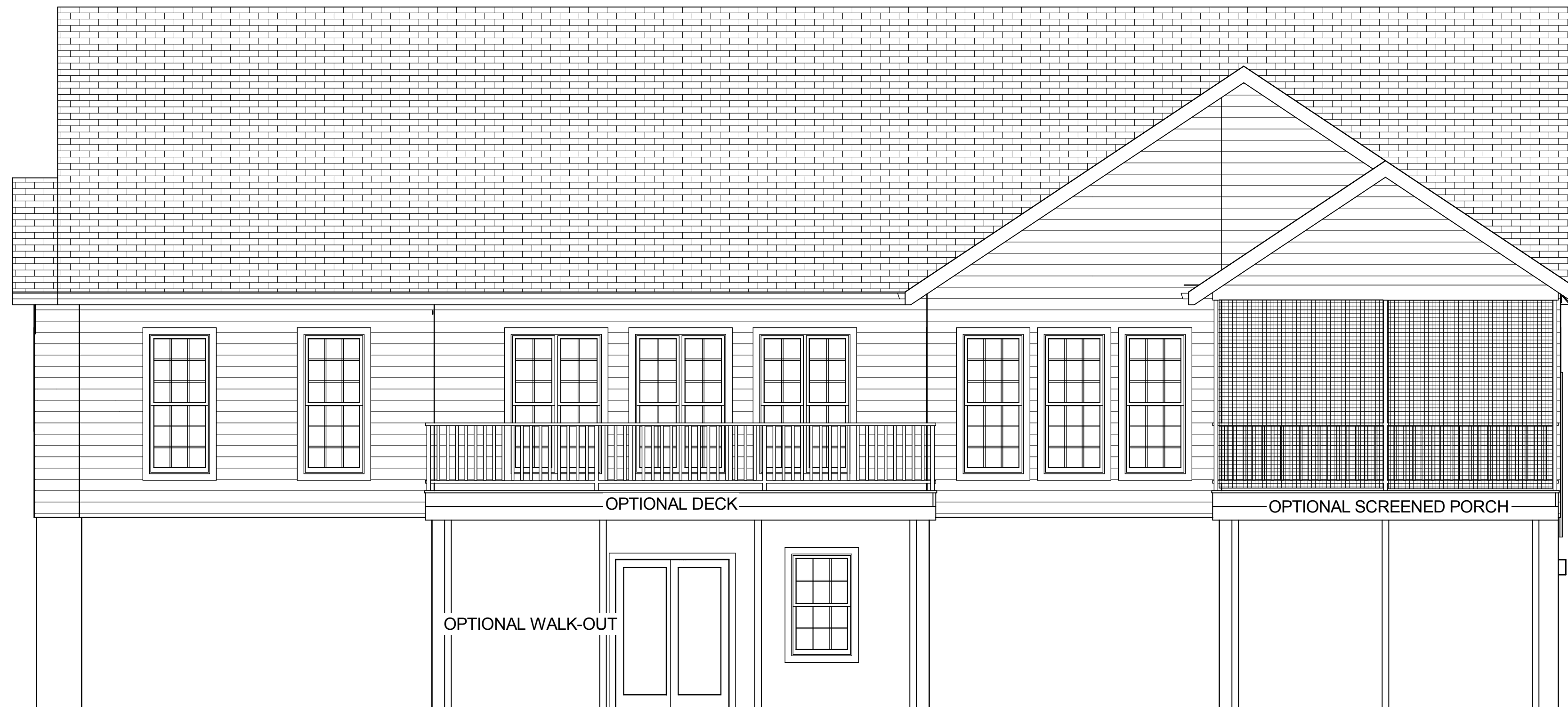
REAR ELEVATION (1/4" = 1')