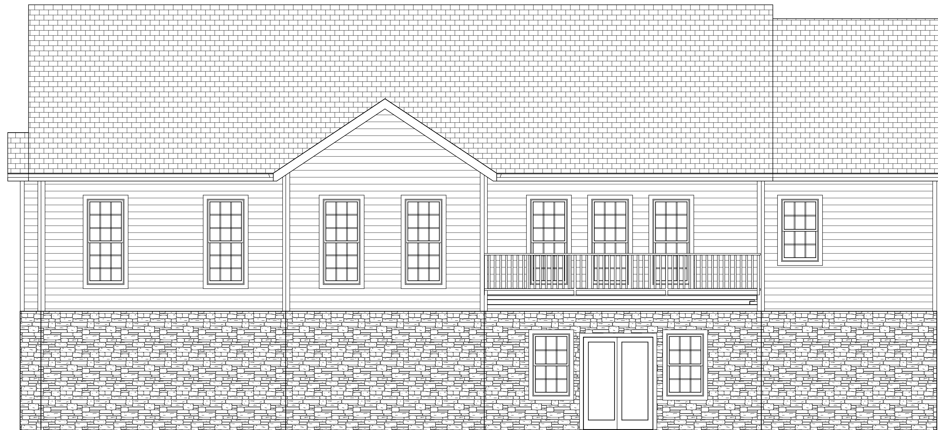
REAR (1/4" = 1')