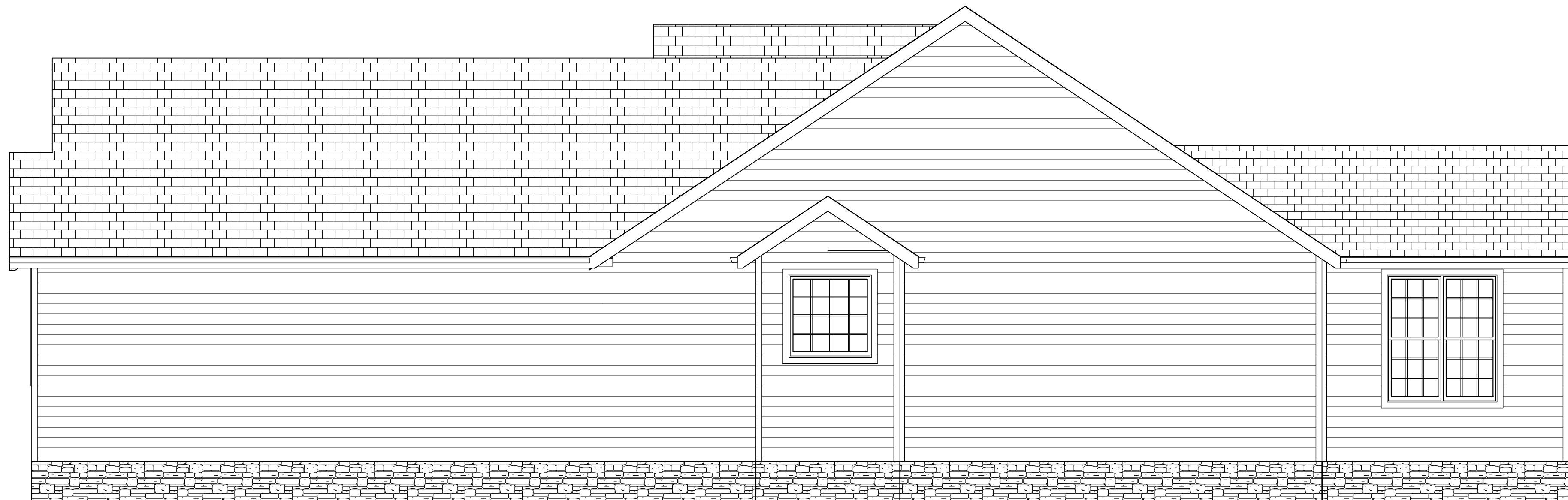
RIGHT (1/4" = 1')