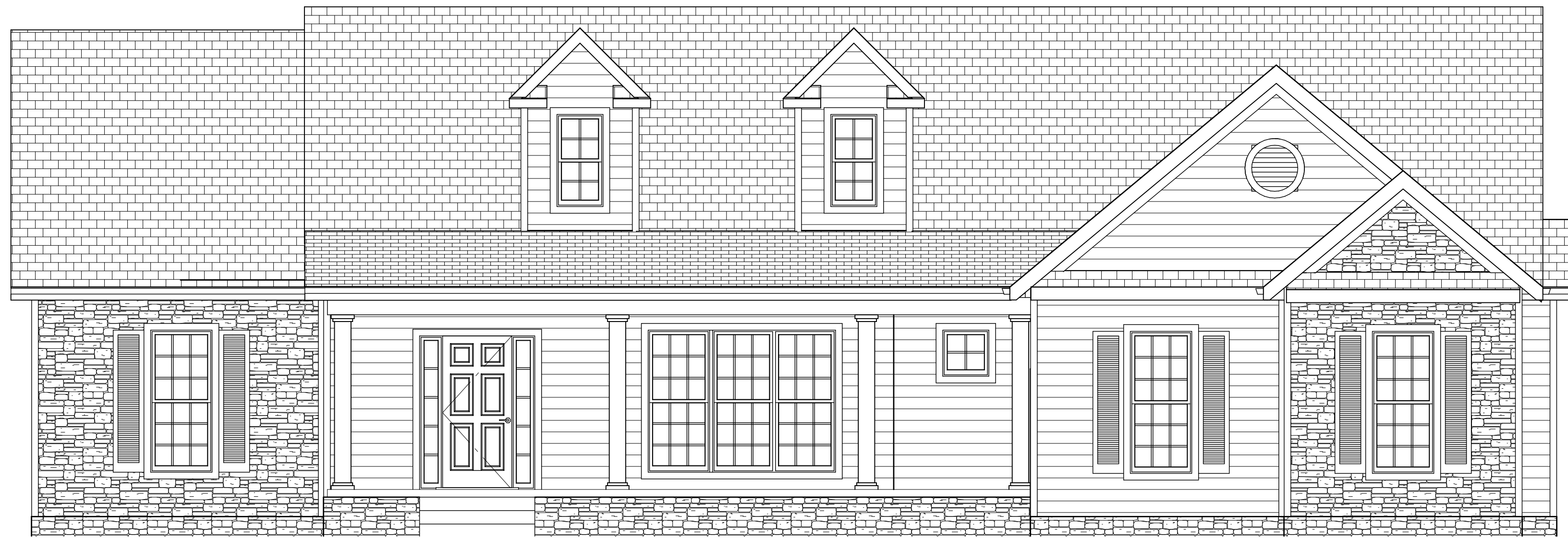
FRONT (1/4" = 1')