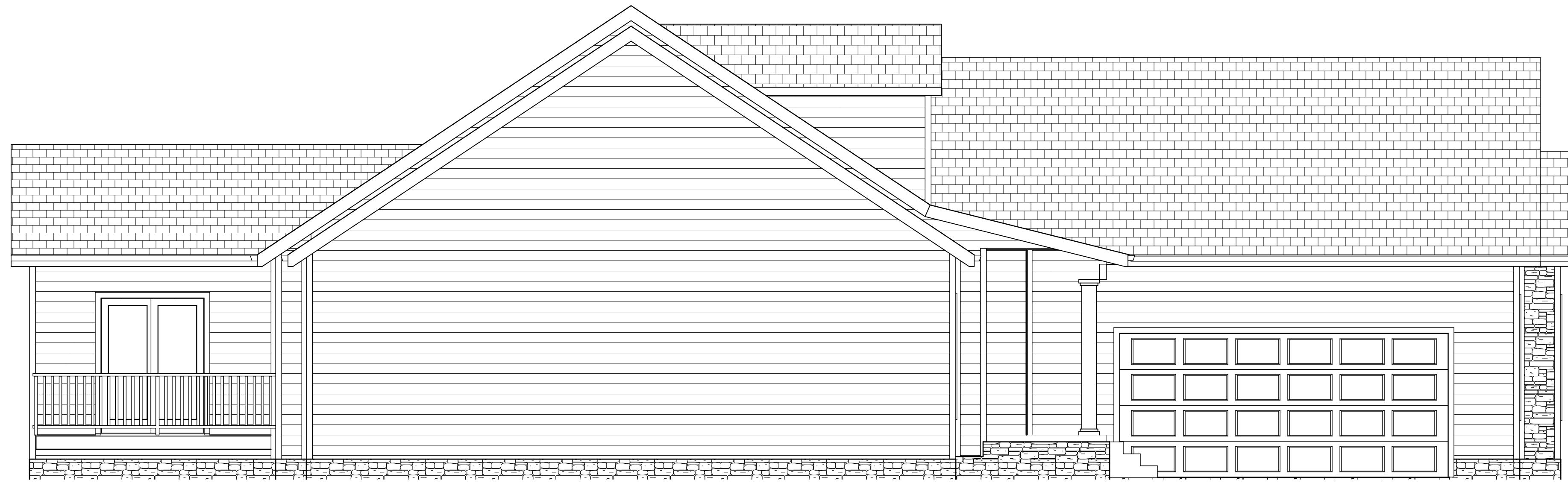
LEFT (1/4" = 1')